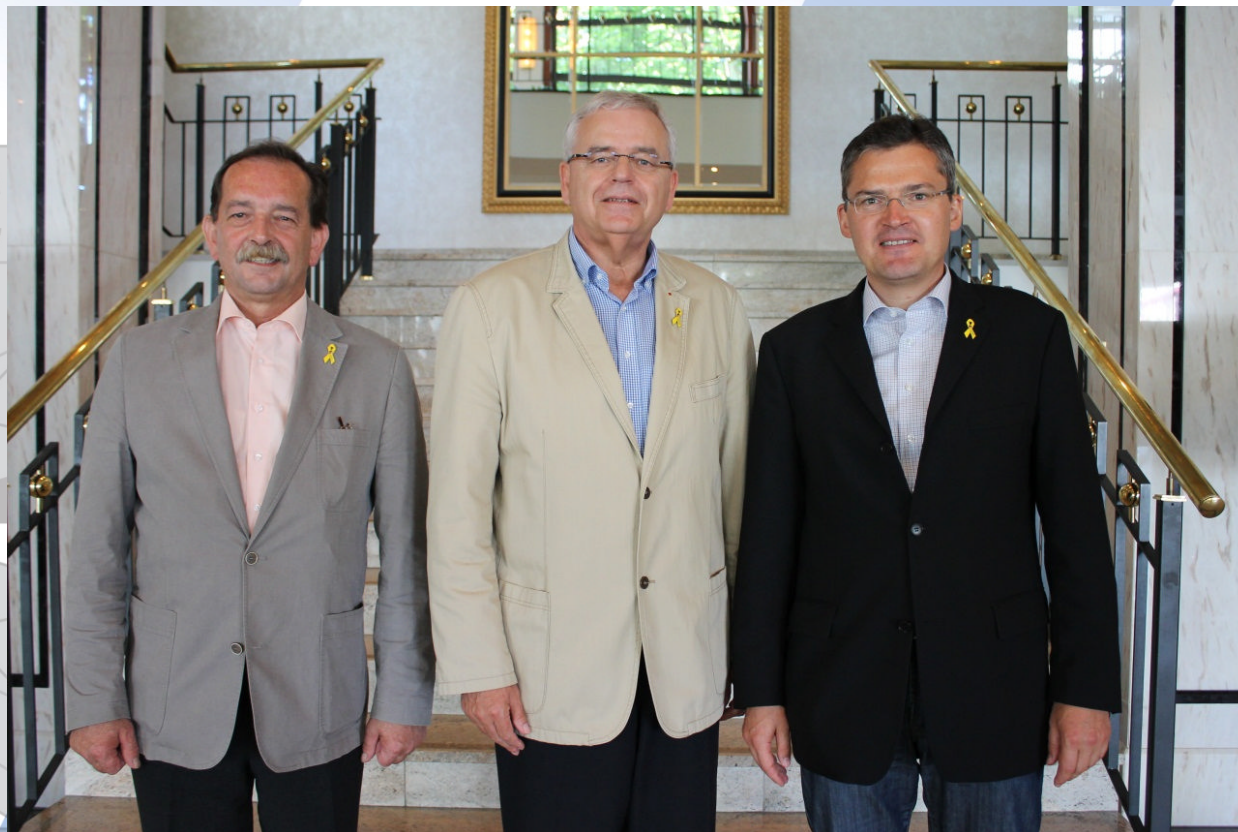
President Deputy Deputy (from right to left)